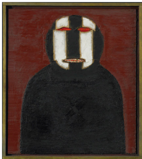
"Madonna" (1976). Erben Werk Hans Schärer/2015 ProLitteris, Zurich; Aargauer Kunsthaus, Aarau

The erotic watercolors look as if they had been made by a different artist. Bristling with joyful hedonism, they betray the hallucinogenic influence of the animated Beatles movie "Yellow Submarine." The weirdly comical erotic drawings of Friedrich Schröder-Sonnenstern also come to mind.