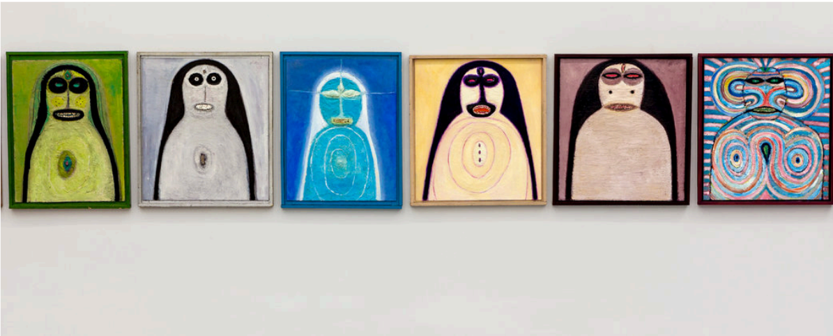
Erotic to psychedelic: Hans Schärer's Madonnas, the focus of his first solo exhibition in the United States, on view at the Swiss Institute. Swiss Institute

One of Switzerland's most celebrated artists, Hans Schärer (1927-1997), created paintings that look as if made by a self-taught psychiatric patient. "Hans Schärer: Madonnas and Erotic Watercolors," at the Swiss Institute, is the first solo exhibition of his art in the United States, and it's wholly delightful. The show presents two bodies of work produced between the late 1960s and the mid-1980s. In the institute's main gallery are 41 portraits of imaginary women, each called "Madonna." On the mezzanine level are 87 watercolors, cartoon images of voluptuous women cheerfully engaging in all kinds of sexual activities.